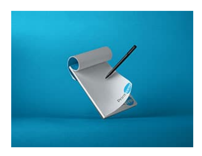
Full Page Size