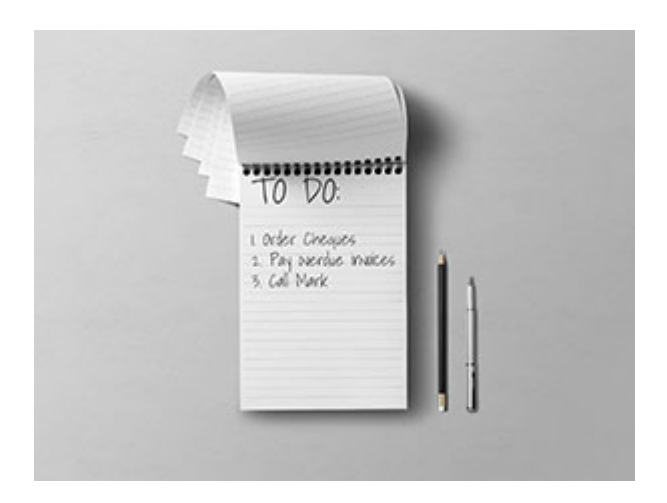
1/4 Page Size

Custom printed notepads are available in three sizes, ranging from a ¼ sheet size to full sheet size. All personalized notepads are printed in full colour and are available with two binding options: regular gluing or coil bound. Select the size below to start your order of custom notepads.